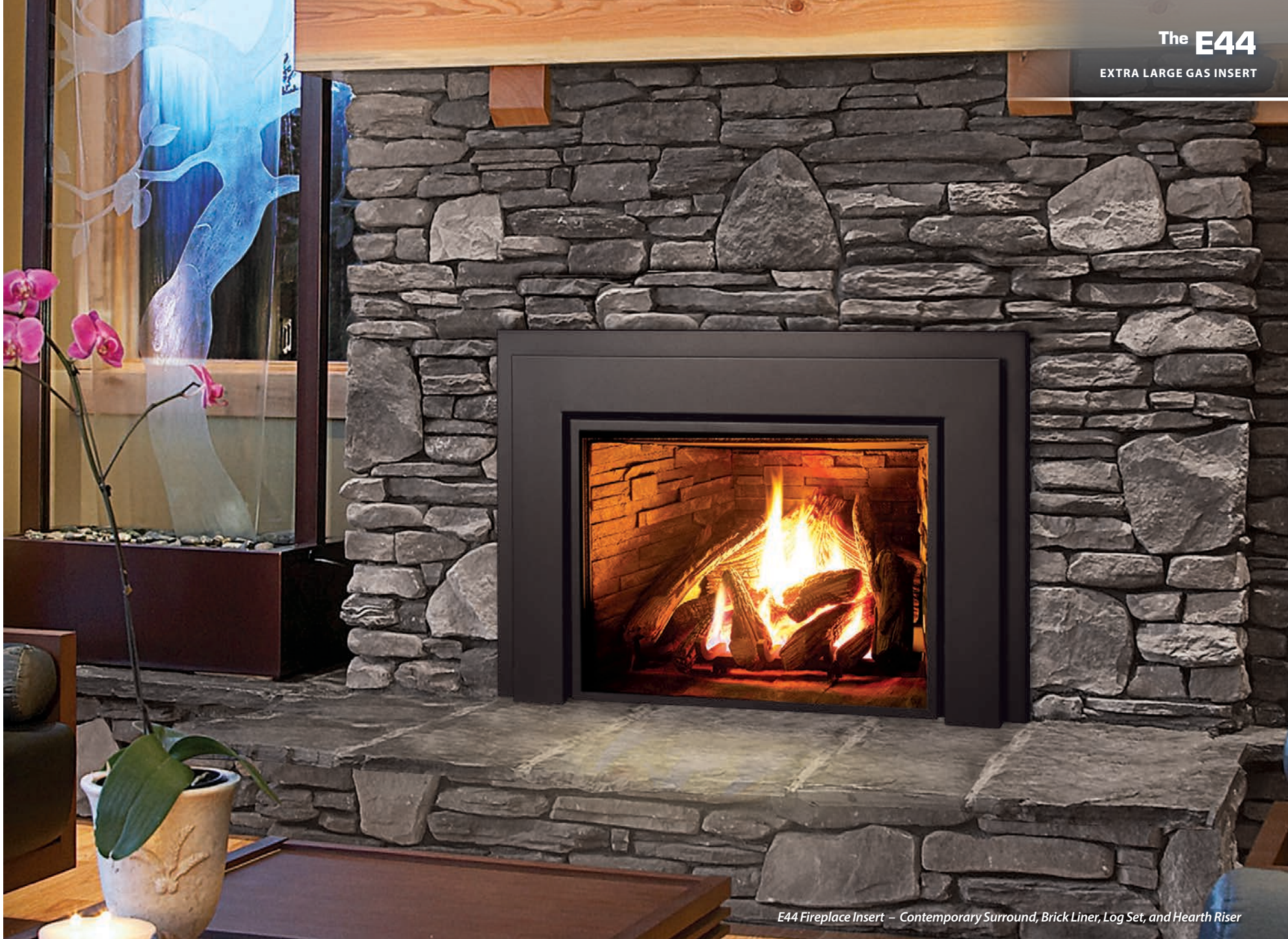
E44 Fireplace Insert – Contemporary Surround, Brick Liner, Log Set, and Hearth Riser