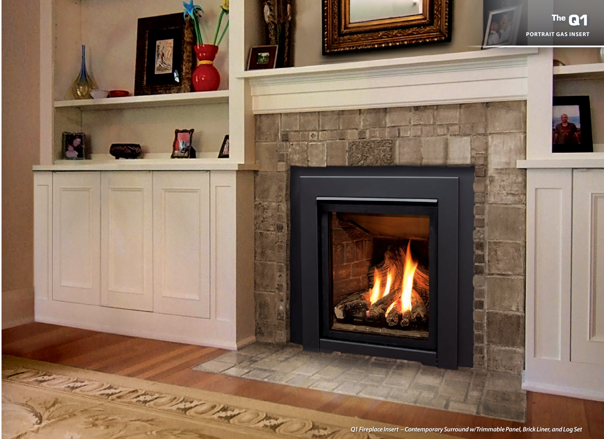
Q1 Fireplace Insert – Contemporary Surround w/Trimmable Panel, Brick Liner, and Log Set