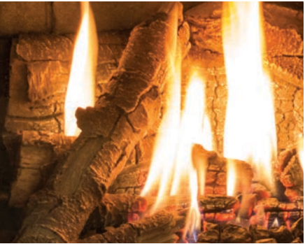
Ultra HD Log Set with Brick Liner

* Turn down is based on a 33% valve and P4 efficiencies output.