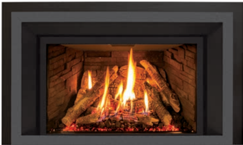
DESIGNER SERIES SURROUND

Available for the E20, E30, E33, EX32, EX35, & E44