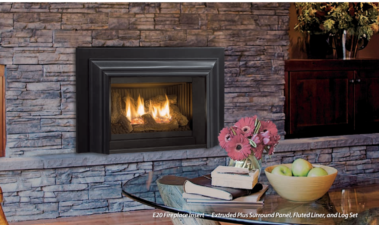
E20 Fireplace Insert – Extruded Plus Surround Panel, Fluted Liner, and Log Set