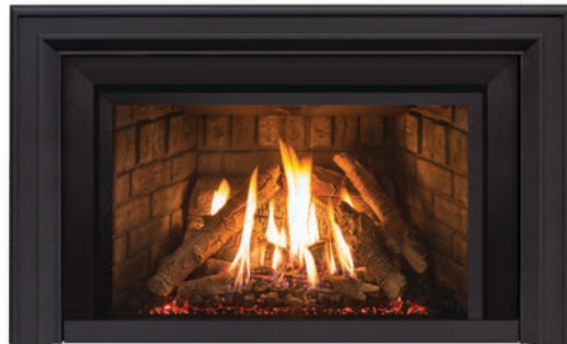
CAST PLUS SURROUND

Available for the E20 & E30 Powder Coated Grey