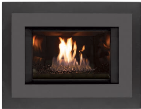
BORDERVIEW PLUS 4S

Available for the E20 & E30 Powder Coated Grey