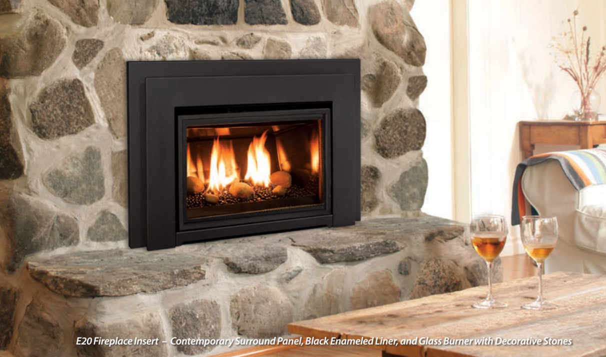
E20 Fireplace Insert – Contemporary Surround Panel, Black Enameled Liner, and Glass Burner with Decorative Stones