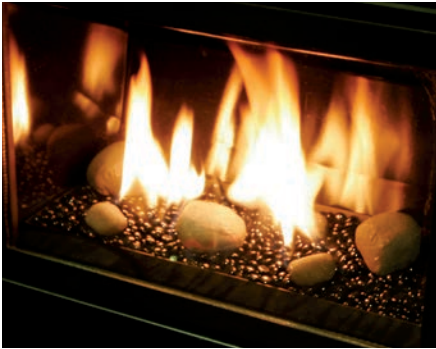
Black Glass with Decorative Stones