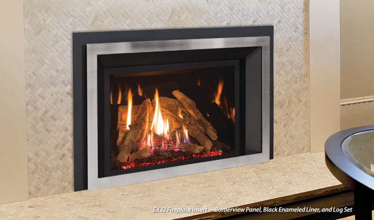
EX32 Fireplace Insert – Borderview Panel, Black Enameled Liner, and Log Set