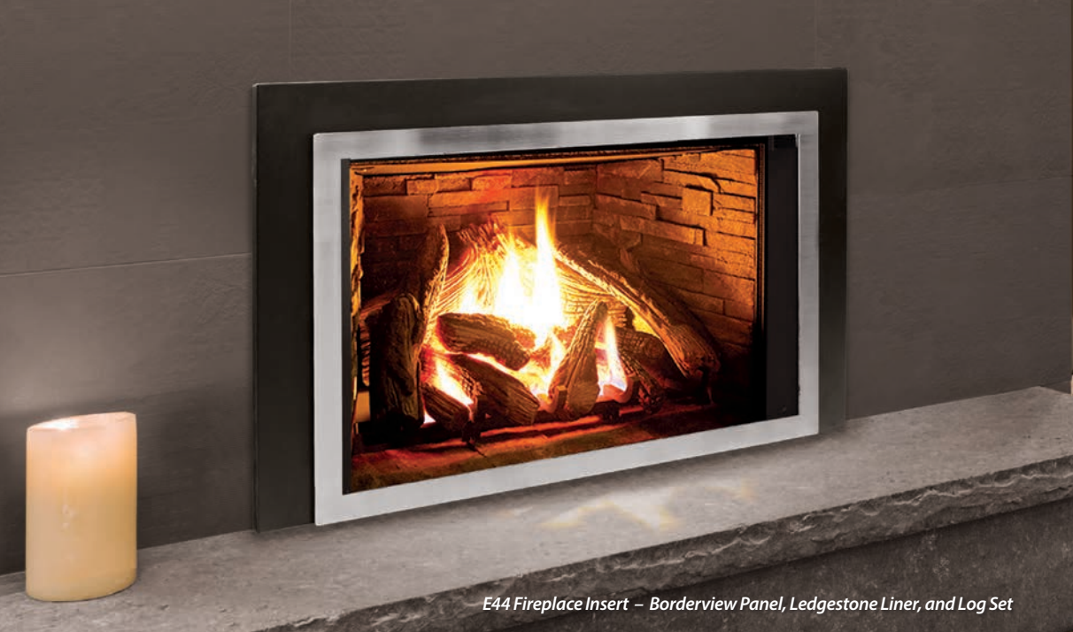
E44 Fireplace Insert – Borderview Panel, Ledgestone Liner, and Log Set