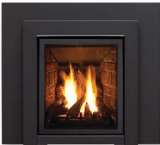
CONTEMPORARY W/TRIMMABLE PANEL