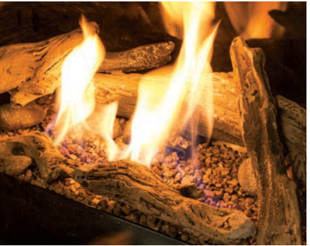
Black Enameled Liner with Driftwood