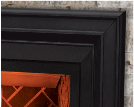
Cast Plus Surround