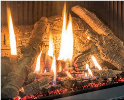
Ultra HD Log Set with Fluted Liner