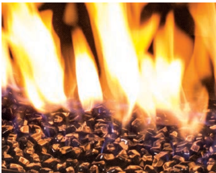
Glass Burner with Diamond Glass