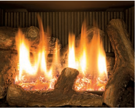
Fluted Liner with Log Set

* Turn down is based on a 50% valve and AFUE efficiencies output.