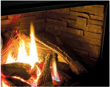
Log Set with Ledgestone Liner