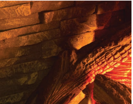
Log Set with Ledgerstone Liner