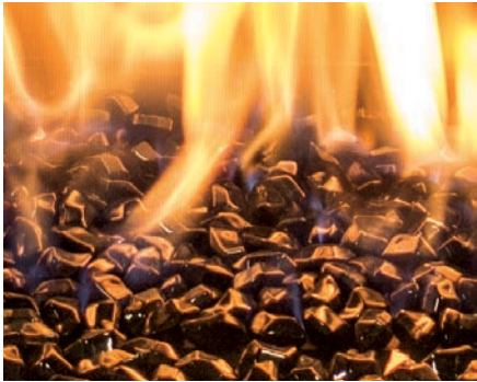
Glass Burner with Diamond Glass