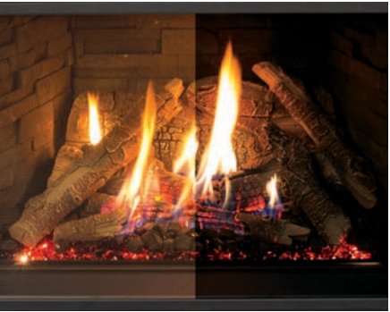
Firebox Top Lighting (Left=On, Right=Off)

* Turn down is based on a 33% valve and P4 efficiencies output.