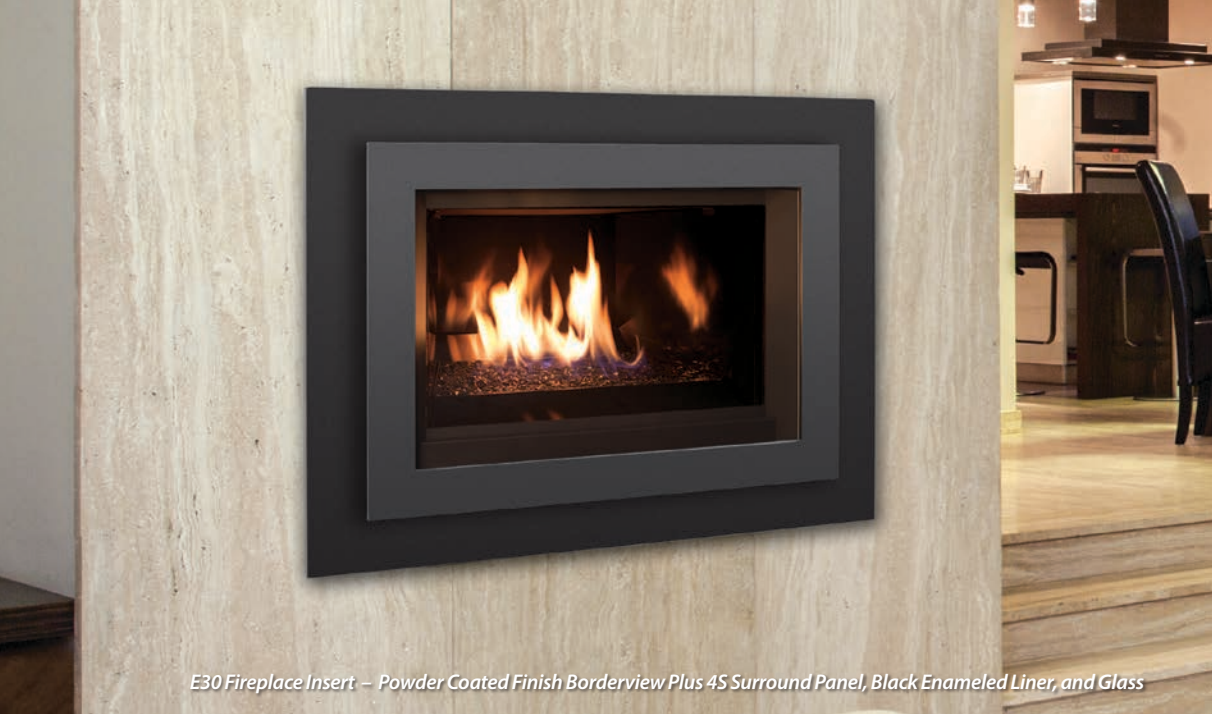
E30 Fireplace Insert – Powder Coated Finish Borderview Plus 4S Surround Panel, Black Enameled Liner, and Glass