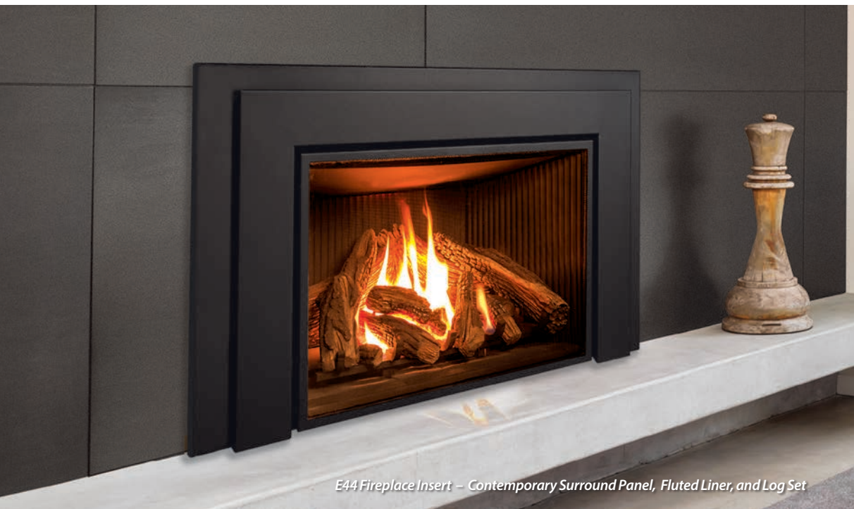
E44 Fireplace Insert – Contemporary Surround Panel, Fluted Liner, and Log Set