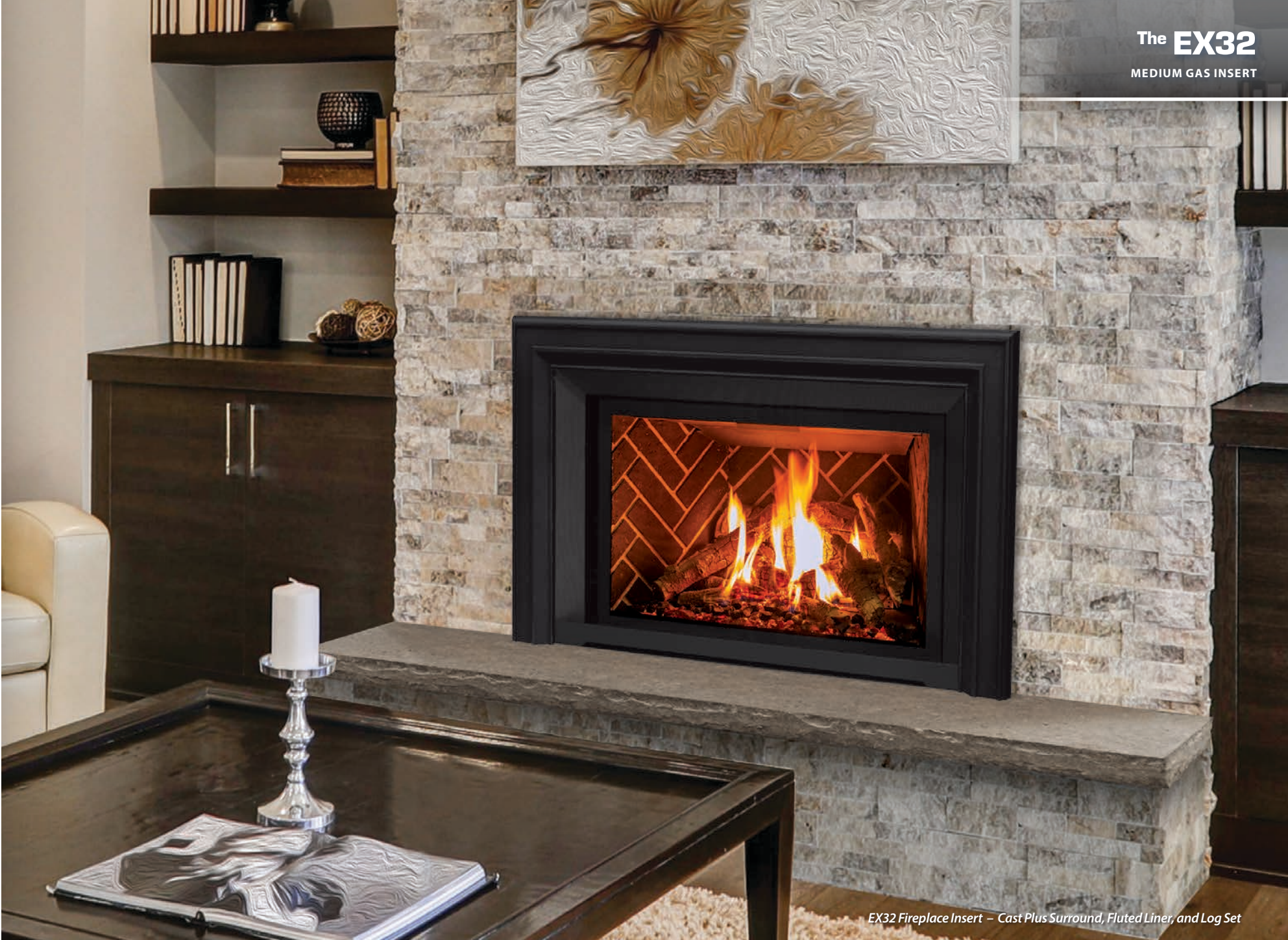
EX32 Fireplace Insert – Cast Plus Surround, Fluted Liner, and Log Set