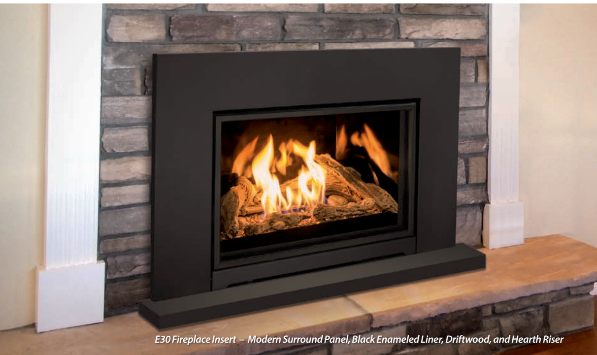
E30 Fireplace Insert – Modern Surround Panel, Black Enameled Liner, Driftwood, and Hearth Riser