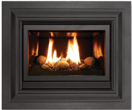
4 - SIDED EXTRUDED