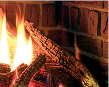
Brick Liner with Log Set

† Based on installation with the Contemporary Surround. Depth can vary by panel.