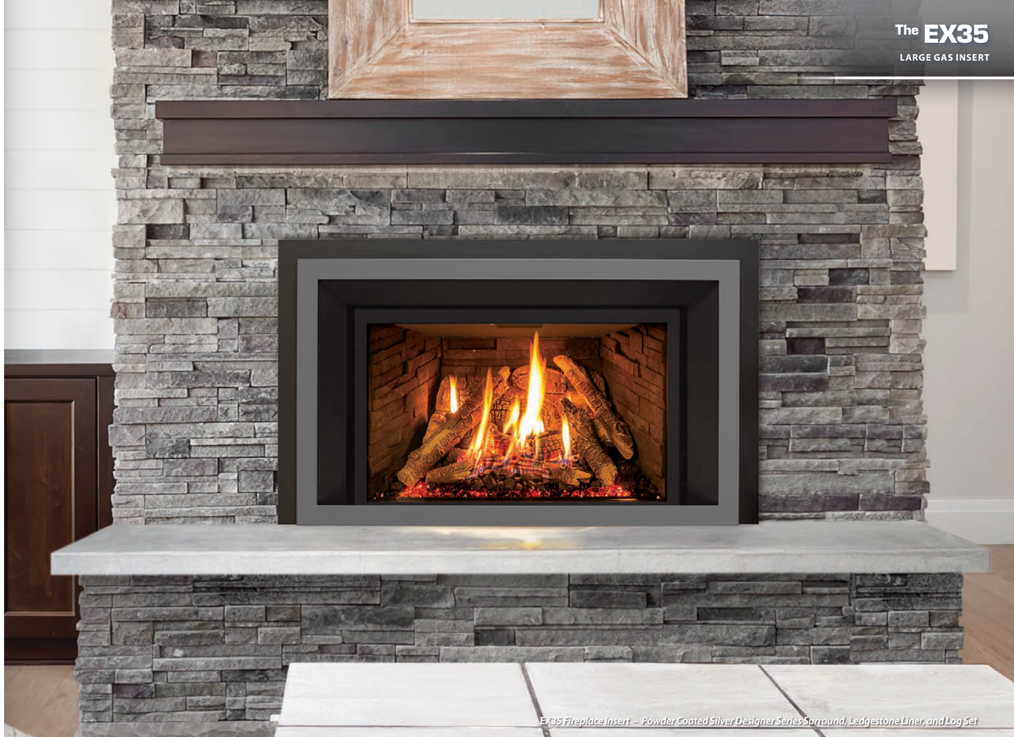
The EX35 LARGE GAS INSERT