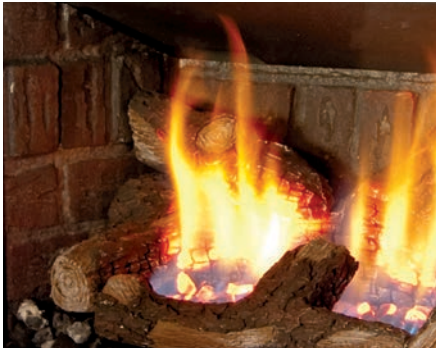
Brick Liner with Log Set