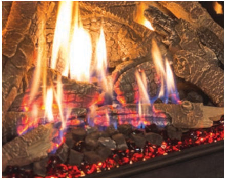
Adjustable Ember Bed Lighting