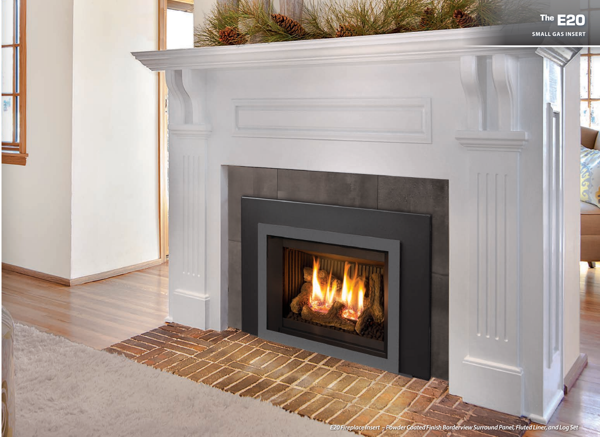
E20 Fireplace Insert – Powder Coated Finish Borderview Surround Panel, Fluted Liner, and Log Set