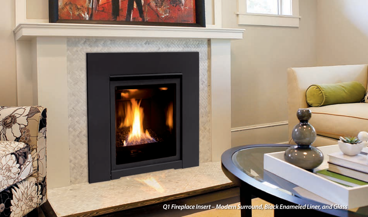
Q1 Fireplace Insert – Modern Surround, Black Enameled Liner, and Glass