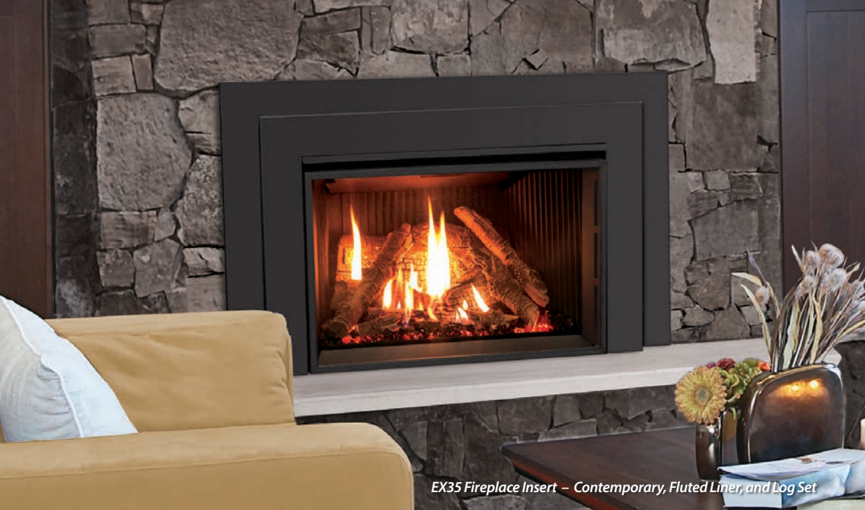
EX35 Fireplace Insert – Contemporary, Fluted Liner, and Log Set