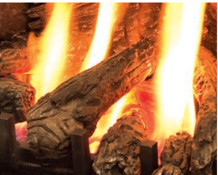
Classic Log Set

* Turn down is based on a 50% valve and AFUE efficiencies output.