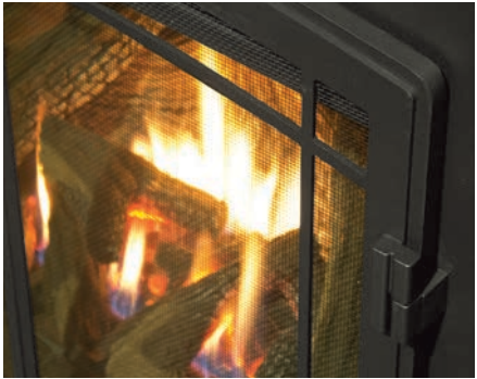
Cape Cod Doors