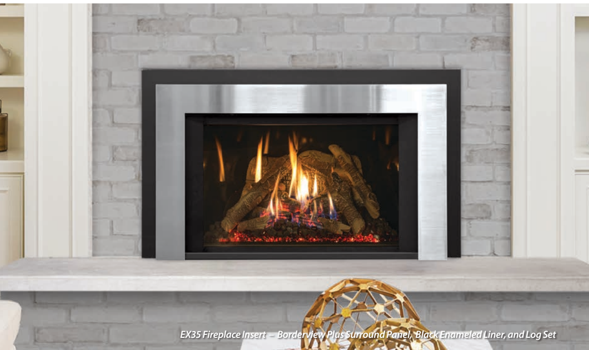
EX35 Fireplace Insert – Borderview Plus Surround Panel, Black Enameled Liner, and Log Set