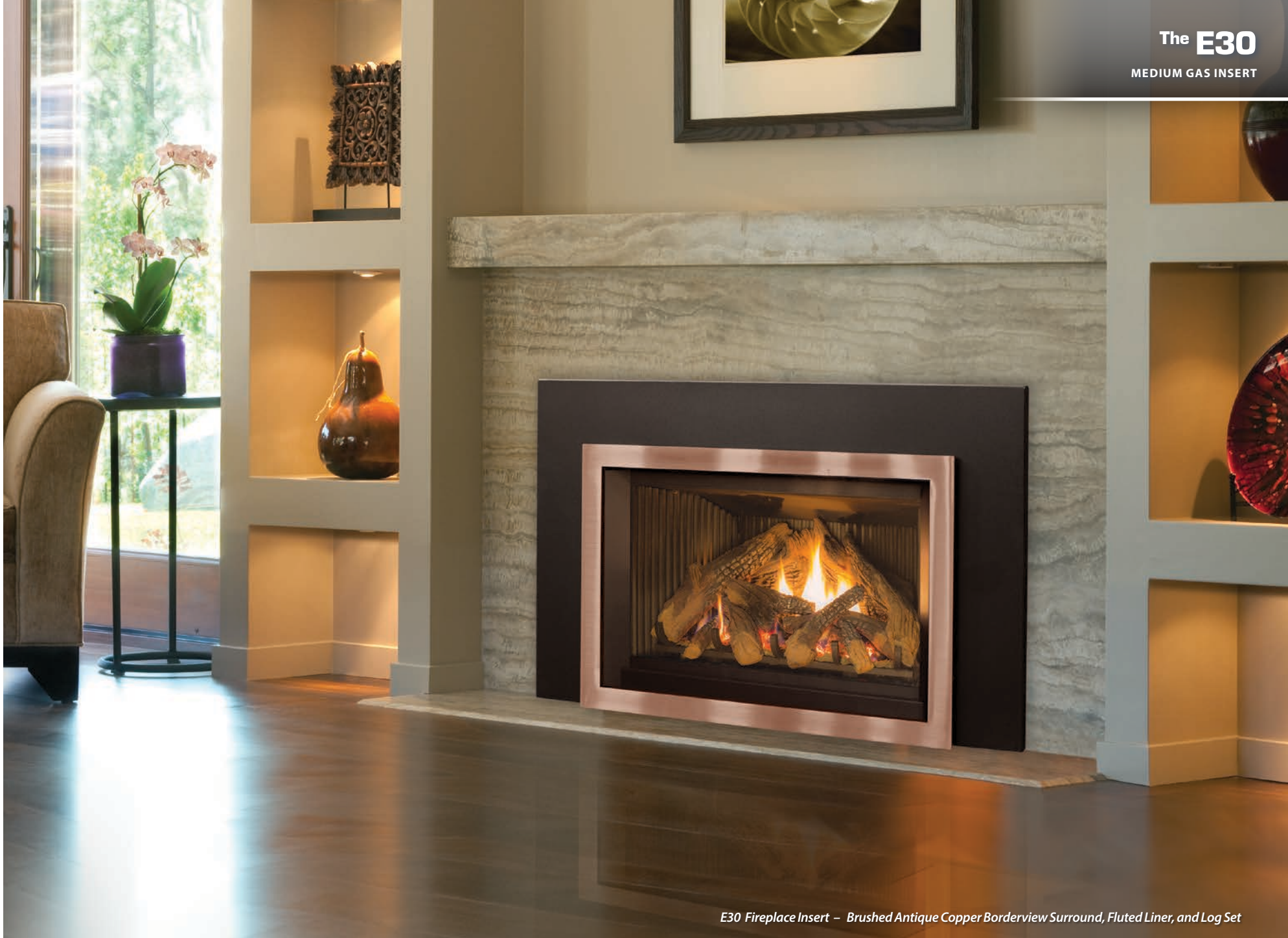
E30 Fireplace Insert – Brushed Antique Copper Borderview Surround, Fluted Liner, and Log Set