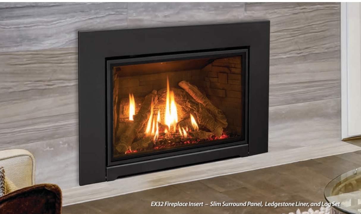
EX32 Fireplace Insert – Slim Surround Panel, LedgeStone Liner, and Log Set