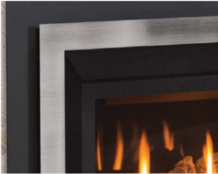
Designer Series Surround