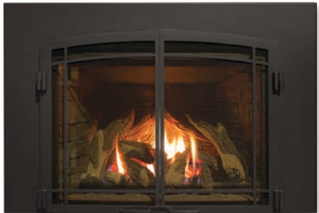
CAPE COD DOORS

Available for the E20, E30, E33, EX32 & EX35 Powder Coated Grey