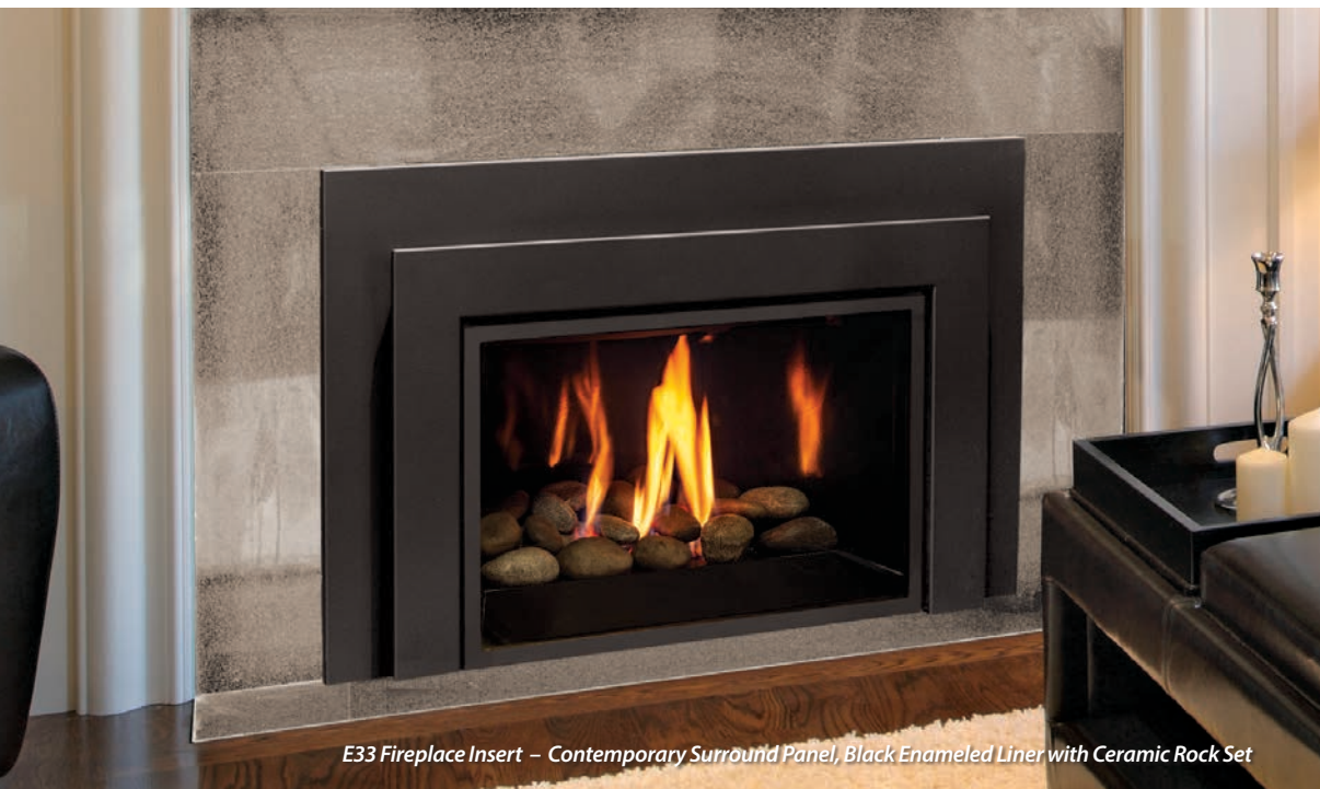
E33 Fireplace Insert – Contemporary Surround Panel, Black Enameled Liner with Ceramic Rock Set