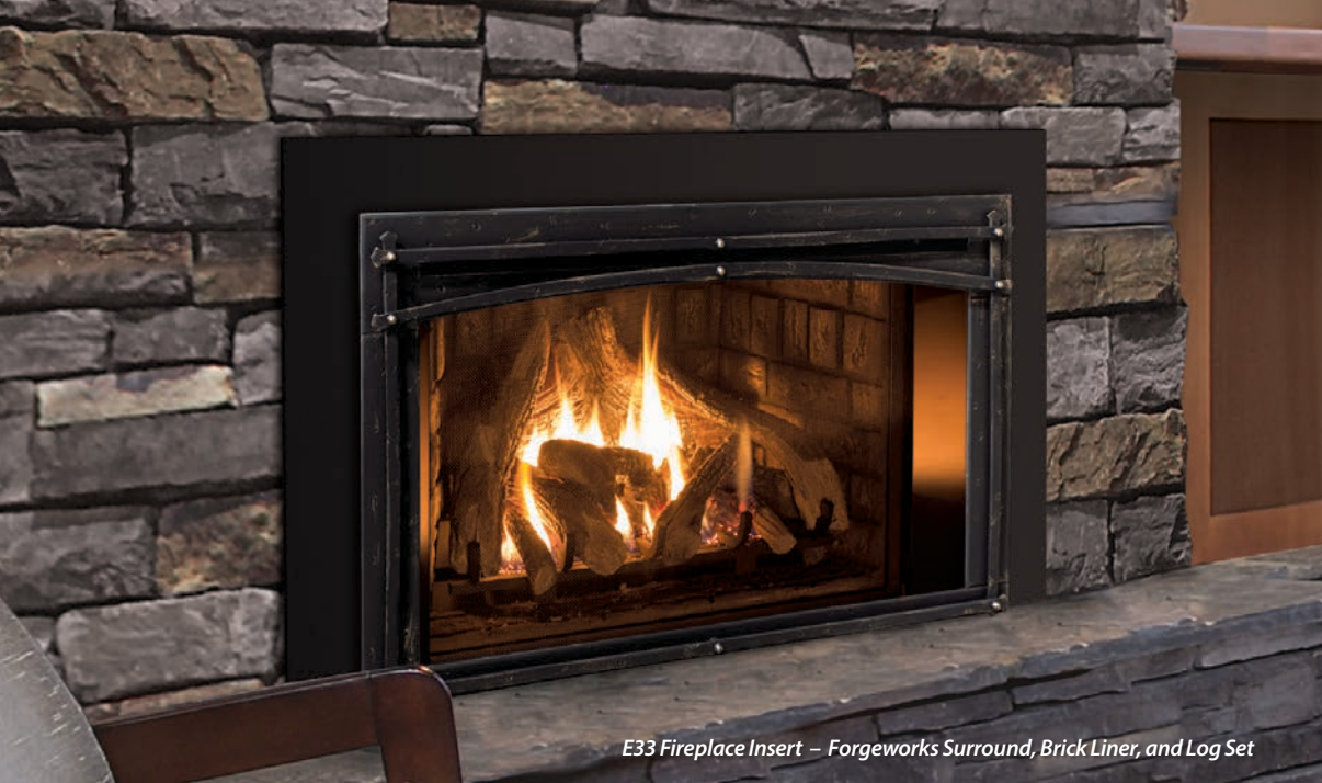
E33 Fireplace Insert – Forgeworks Surround, Brick Liner, and Log Set