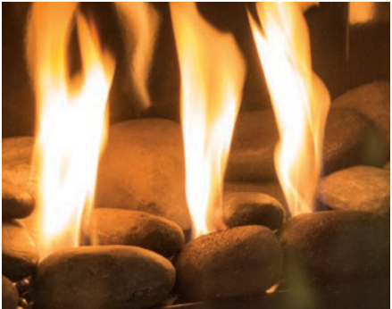
Ceramic Rock Set