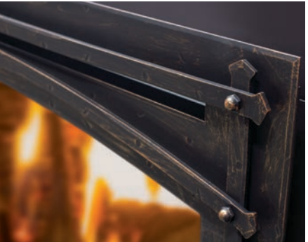
Midnight Bronze Forgeworks Surround

† Based on installation with the Contemporary Surround. Depth can vary by panel.