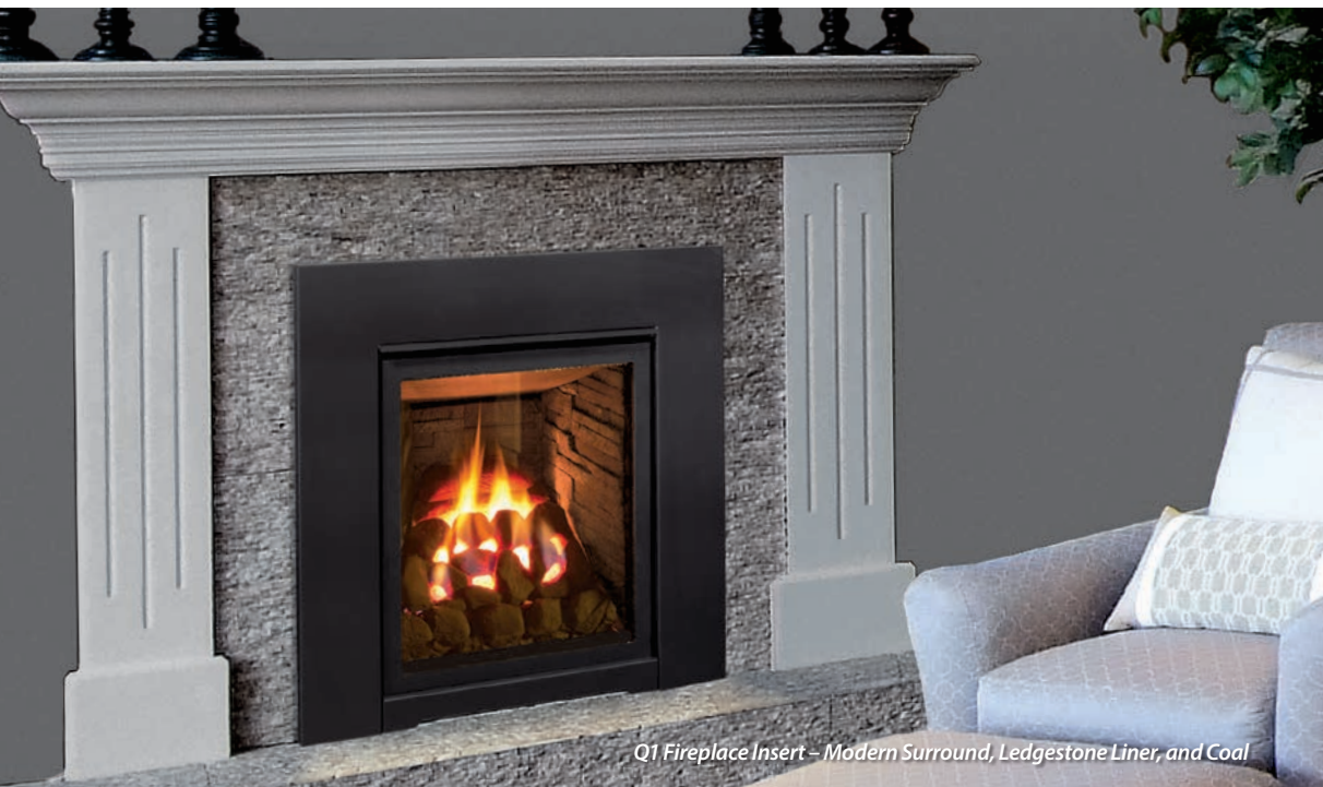
Q1 Fireplace Insert – Modern Surround, LedgeStone Liner, and Coal