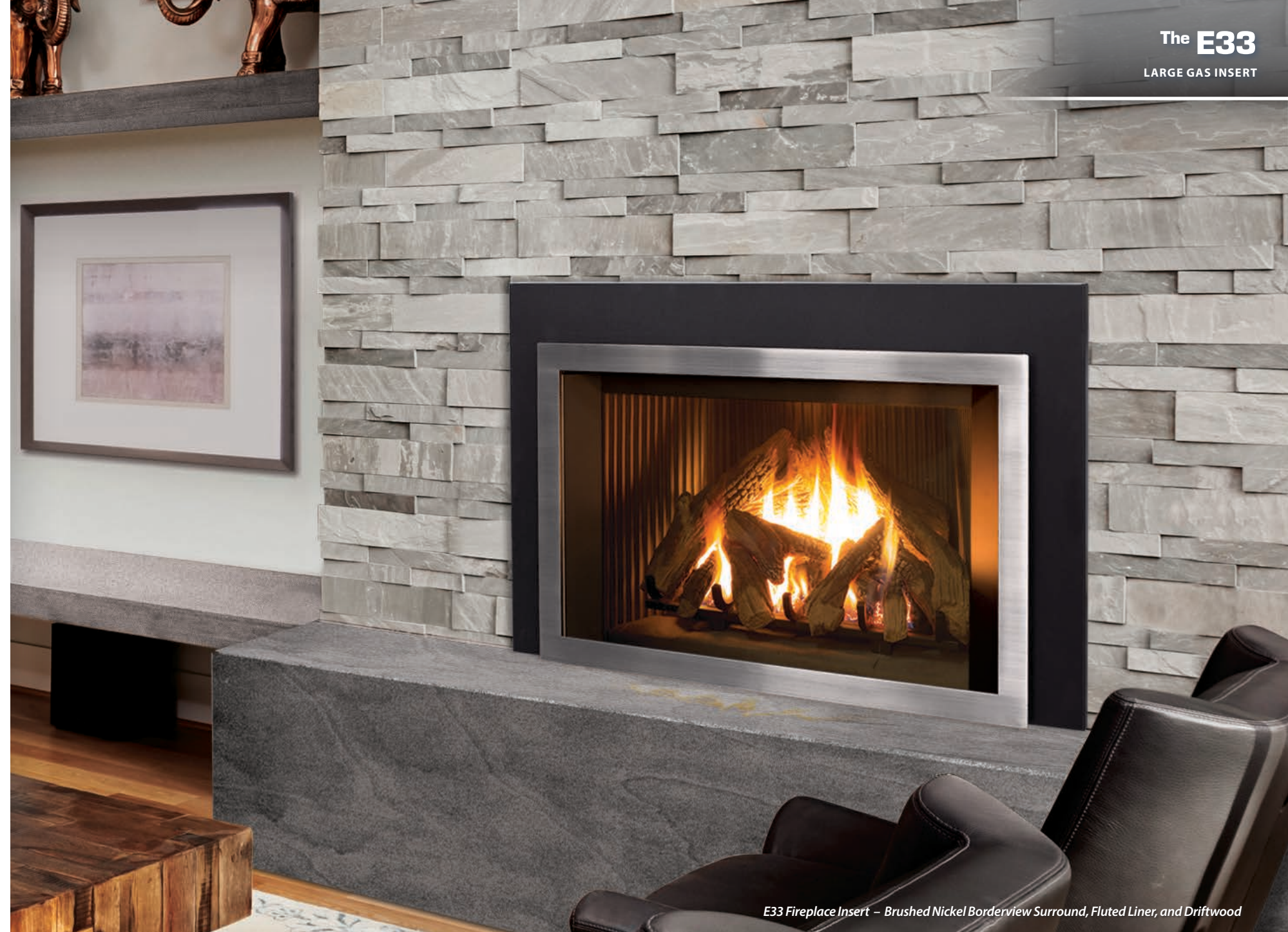
E33 Fireplace Insert – Brushed Nickel Borderview Surround, Fluted Liner, and Driftwood